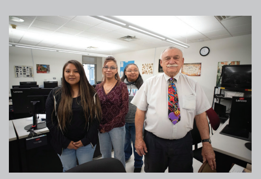
A.A.S. - Administrative Office Specialist