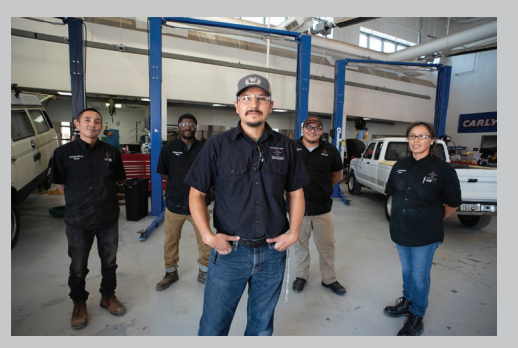
A.A.S. - Automotive Technology